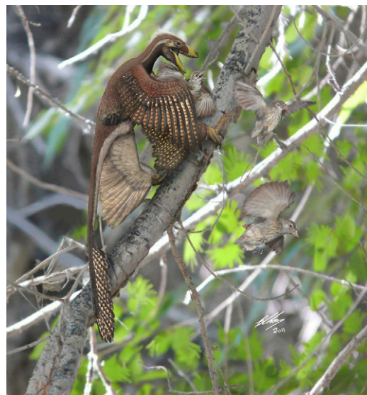
Fig. 3. Reconstruction of the life habits of M. gui .

Unlike other birds known from the Jehol, all known enantiornithines possess pedal morphologies suggesting they were adapted for arboreal environments rather than for foraging on the ground or in aquatic environments (31, 32). This understanding is supported by pedal proportions, which have been shown in modern birds to be indicative of ecology (33–34), as well as in the morphology of the foot, which is better adapted for perching than walking, with large recurved claws and a hallux that is positioned low on the tarsometatarsus. Although digit III cannot be measured in this specimen (nor can digit IV completely), the penultimate phalanx in digits II and IV are longer than the proximal phalanges, consistent with arboreal habitats