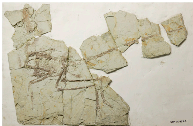
Fig. S1. Counterslab of Microraptor sp. (IVPP V17972B).