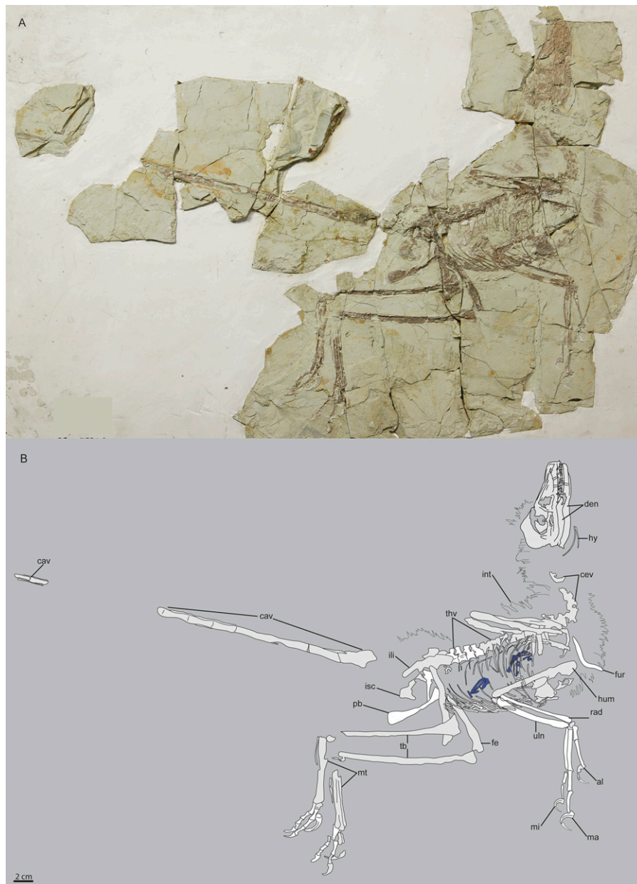
Fig. 1. Photograph (A) and line drawing (B) of IVPP V17972A. Anatomical abbreviations: ald, alular digit; cav, caudal vertebrae; cev, cervical vertebrae; den, dentary; fe, femur; fur, furcula; hum, humerus; hy, hyoid bones; ili, ilium; int, integument; isc, ischium; mad, major digit; mid, minor digit; mt, metatarsals; pb, pubis; rad, radius; tb, tibia; thv, thoracic vertebrae; ul, ulna.

which are subequal. Metatarsal IV is the thinnest, as in other enantiornithines, and all three metatarsals are located in the same plane along their entire lengths, lacking the plantar displacement of metatarsal III that characterizes the more advanced ornithurine birds. The trochlea of metatarsal II is the widest; the trochlea of metatarsal IV is reduced. The pedal phalanges are all elongate and delicate; digit II is more robust than the other digits. The claws are all large and recurved (as opposed to the short, uncurved claws present in the cursorial ornithurine birds) with deep lateral grooves. Although the individual is too incomplete to assign to a specific taxon, we tentatively assign the specimen to Cathayornithiformes, the most prevalent enantiornithine group in the Jehol, based on size and the relative trochlear position of the tarsometatarsus (16).